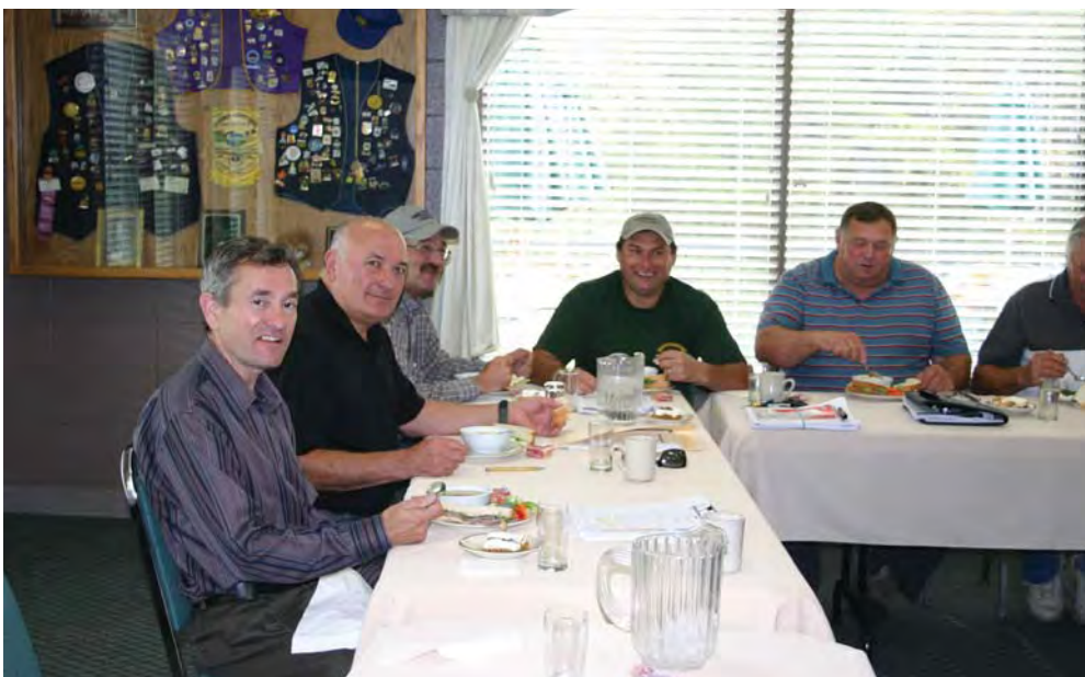
Diamond Development Advisory Committee members at September 15, 2009, meeting

The Technical Report documenting the Mineral Resource Estimate previously released for the Orion South Kimberlite was filed